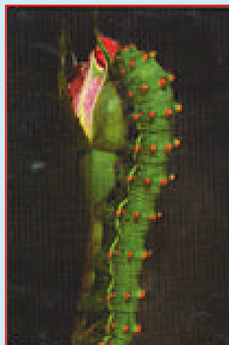
Forin Umberto Cavarzere(VE)